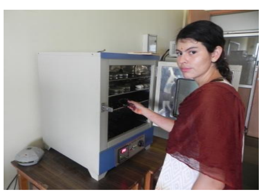
Cell culture lab