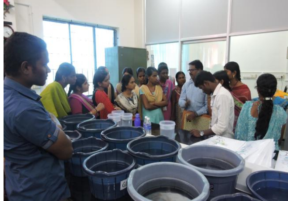
Group Project-DAHM students