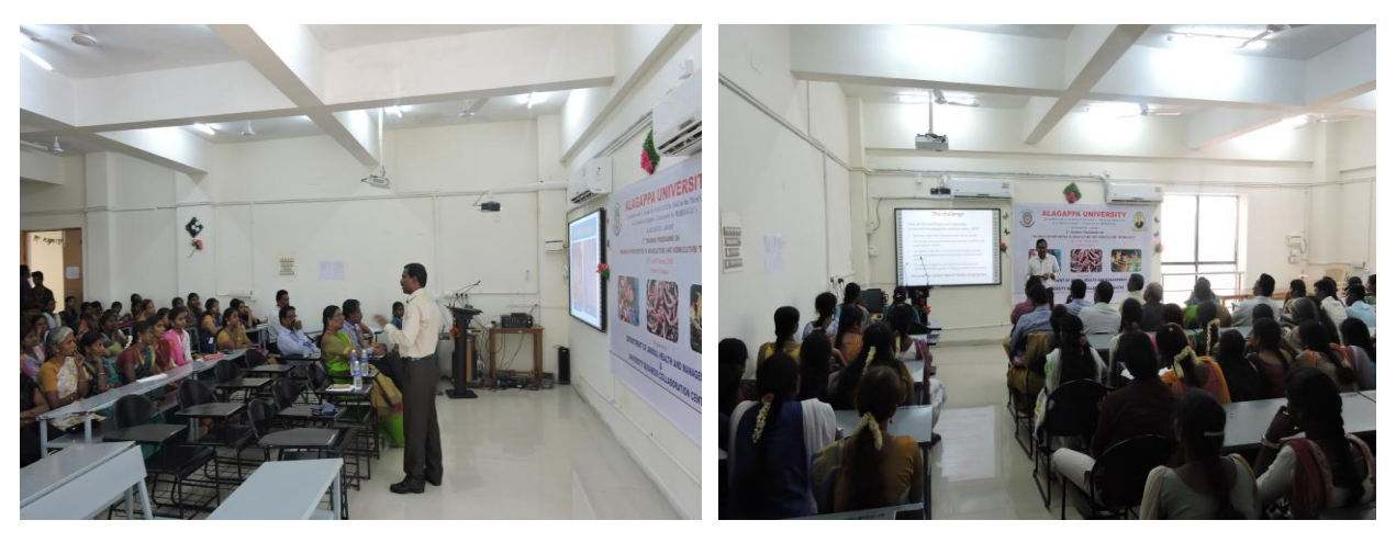
The Department of Animal Health and Management celebrated the Parents-Teachers Meet 2018 on March 24, 2018, at 10:30 a.m. and also celebrated the Alumni Meeting 2018 on March 24, 2018, at 2:30 p.m.