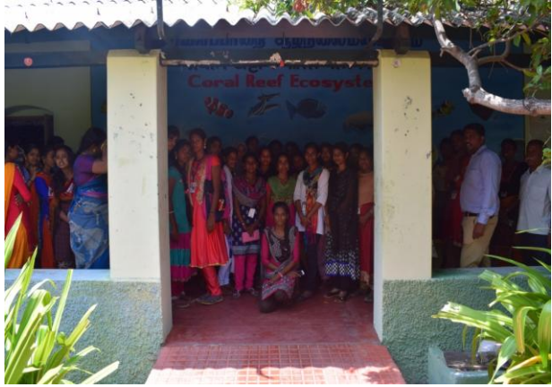
Seaweed culture -Mandabam