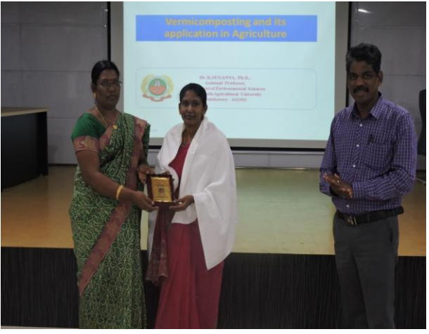
The Department of Animal Health and Management conducts a journal club meeting every Friday.